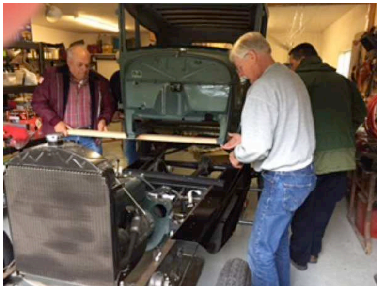
Positioning the Tudor Body on the Frame 1